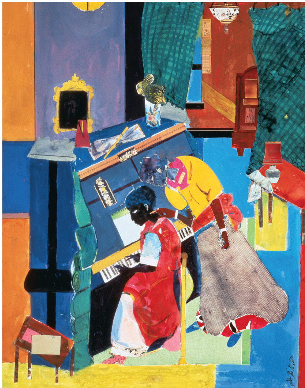
Romare Bearden, The Piano Lesson , collage on board, 29" x 22", 1983. SCAD Museum of Art, Walter O. Evans Collection of African American Art.