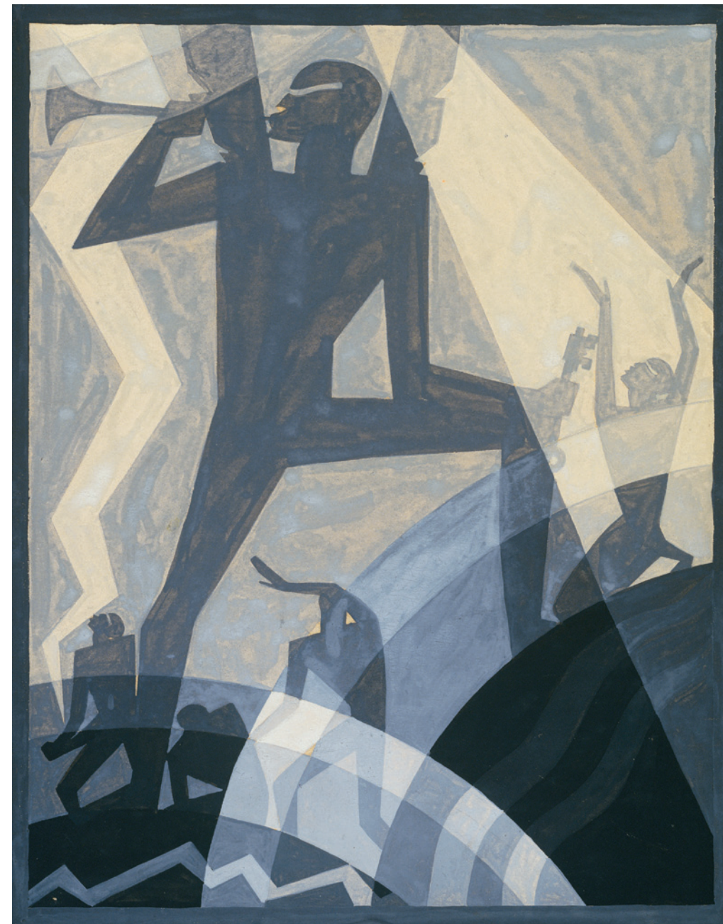
Aaron Douglas, The Judgment Day , gouache on paper, 11.75" x 9", 1927. SCAD Museum of Art, Walter O. Evans Collection of African American Art.